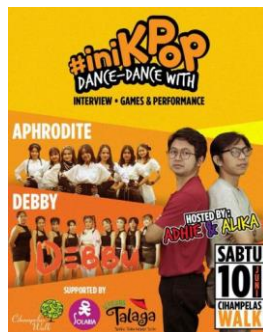
Figure 4.1 INIKPOP Event Poster

This aligns with the establishment of advertising and promotional media collaboration with event organizers, where promotional content is published on the @inikpop Instagram account. This strategy ensures that information is widely disseminated through social media, maximizing audience reach and engagement.