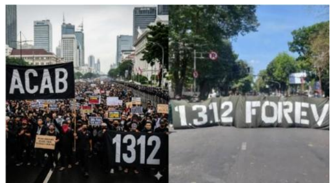
Figure 1. Mass Action with #ACAB and #1312 Banners in Indonesia

Based on the description and presentation of the research, there is a research gap, where unlike previous studies that generally focus on hashtag activism as a means of digital mobilization or analysis of social criticism discourse in bold media, this study specifically examines the influence of the use