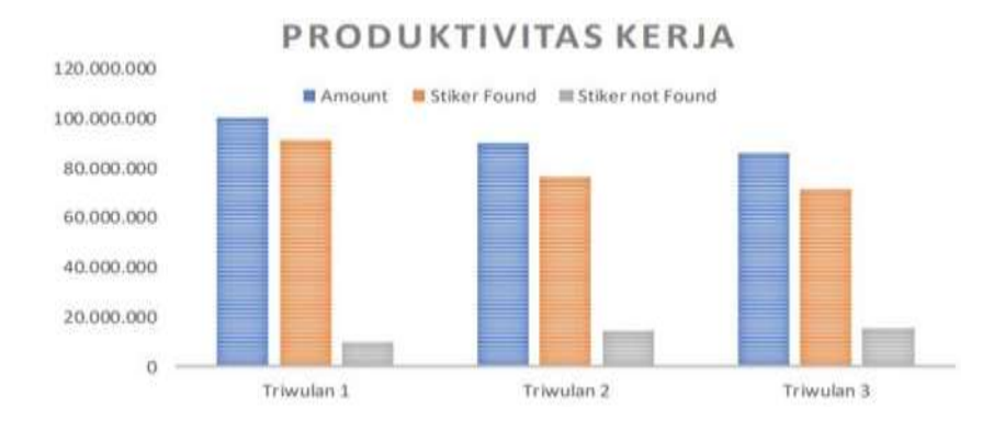
Figure 1 Work Productivity Graph