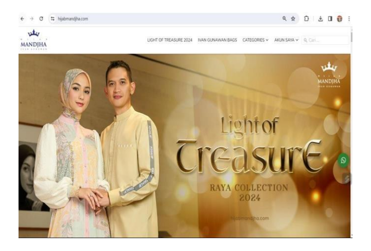
Figure 2 Mandjha Website

Mandjha uses Berdu as a platform to market their products digitally through their website. Berdu is known for its attractive appearance and ease of use. The Mandjha website displays various complete features regarding products, makes it easier for customers to find the products they need, and even provides a WhatsApp chat feature for direct questions from customers.